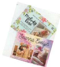
When Moms and babes are baptized into the family of God, it's time to celebrate!

the spiritual encouragement found through attending that host congregation also bears fruit for a lifetime. But, beyond all the benefits for this lifetime, the Redeeming Life Outreach Ministry Homes provide help in meeting Jesus or returning to a life of faith in Him. That, dear